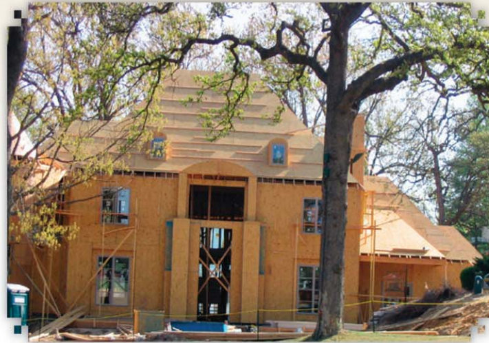
Six $1-million dollar plus homes are already under construction.