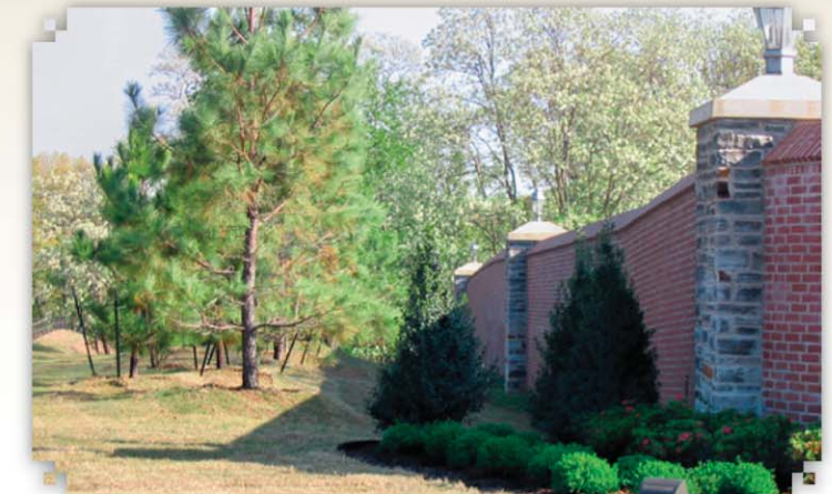
Tour Belmont now and choose your estate home site with resort living amenities. 109th and Louisville - close to shopping and entertainment, Jenks schools and medical facilities