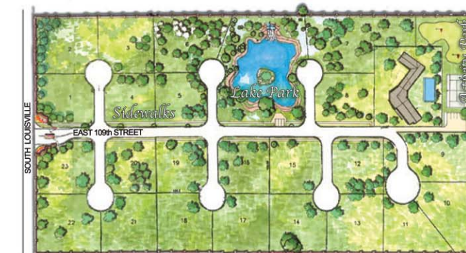
For plats and pricing call Wenrick Development.

Belmont has been selected as Feature Development for the 2006 "Street of Dreams" spectacular this October. Come Tour now for the best lot selection.