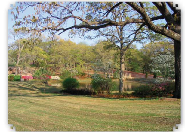
The twenty-three families of Belmont will truly enjoy Tulsa's most enviable lifestyle.